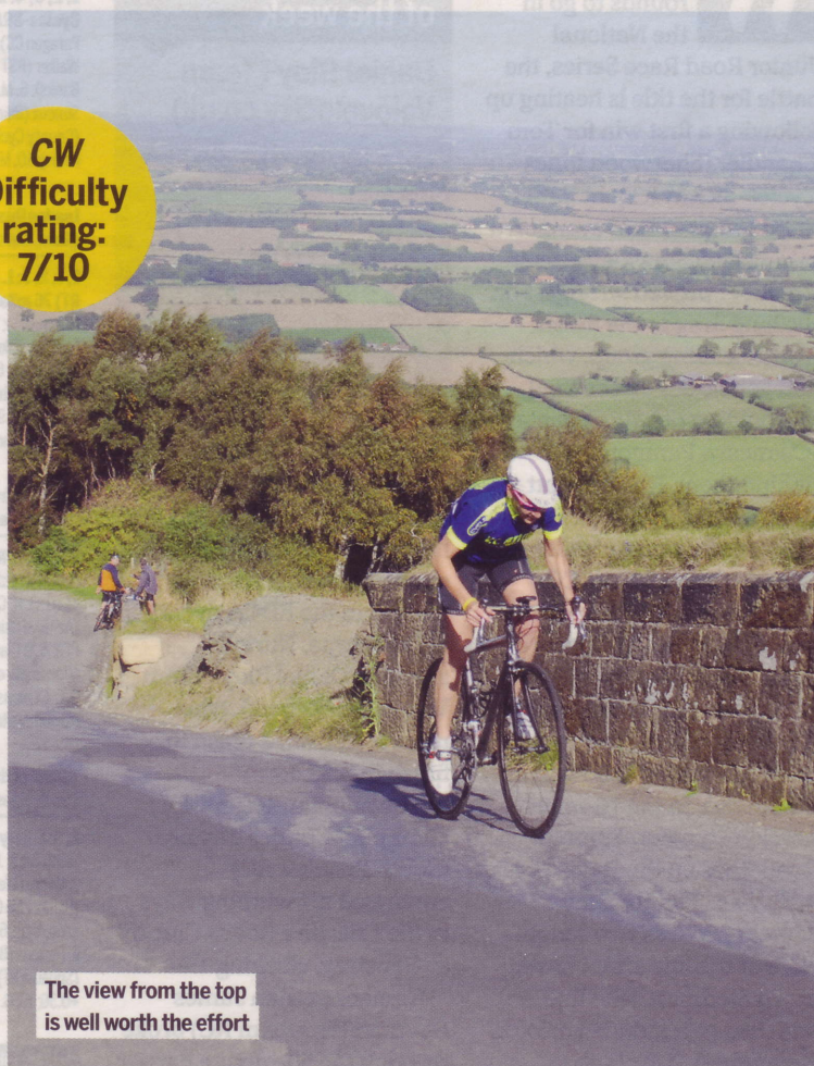
The view from the top is well worth the effort